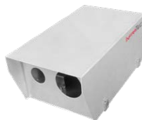
Protective housing for one thermographic camera and visual camera each, e.g. for use in waste bunkers