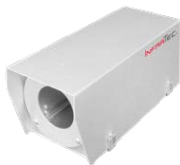
Protective housing for a thermographic camera, e.g. for outdoor use