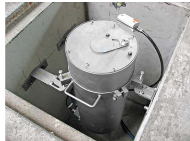
Protective housing with purge collar, cooling and pneumatically driven protective cover