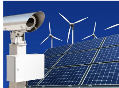
Stainless steel protective housing with control cabinet in outdoor use