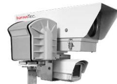
Protective housing for thermographic camera and visual camera on a pan-tilt head