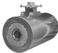
Special protective housing for applications in harsh industrial environments, e.g. for monitoring casting ladles or slag detection