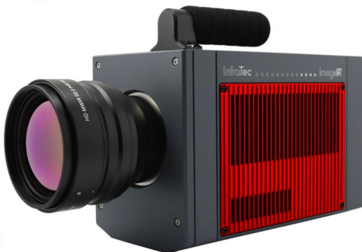
Fig. 1: The infrared camera ImageIR® 9400 hp

With the ImageIR® 9400 hp InfraTec launched a flexible camera system that can partially override these contradictory preconditions.