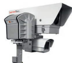
Combination of different types of protective housings incl. pan/tilt head