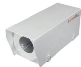
Protective housing for a thermographic camera