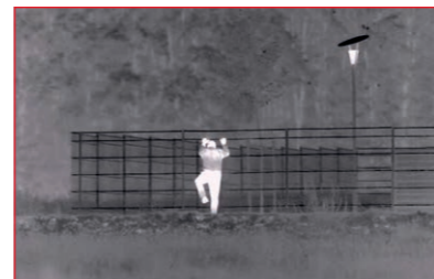
High range supports convenient monitoring of spacious premises