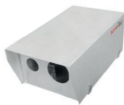
Protective housing for a thermographic camera and visual camera