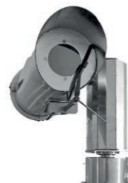
Special protective housing (individual production)