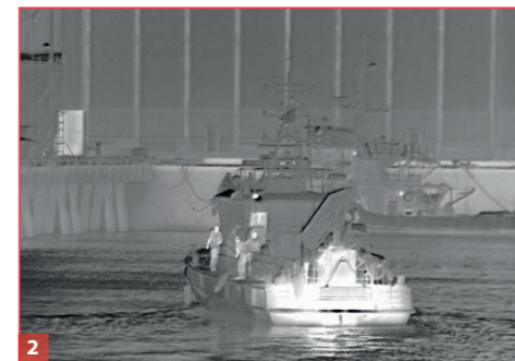
1) Business premises 2) Harbour surveillance