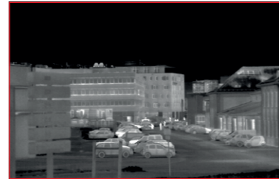
Precise monitoring through the targeted selection of sectors