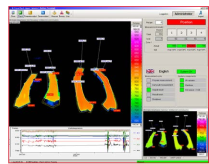
Test software PRESS-CHECK

With highly reliable components, special protective housings, flexible layout and data interfaces, the test system can be easily adapted and integrated to the conditions of different press lines.