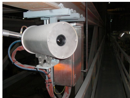
Thermal camera with protective housing