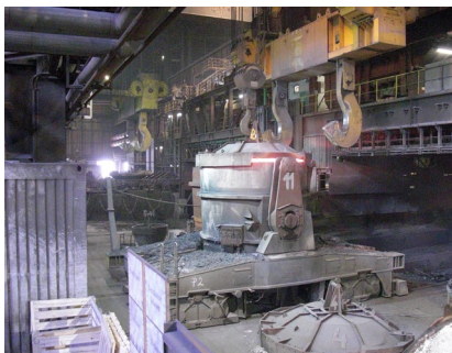
Ladle during casting process

Five precise and industrial-suited thermographic cameras now monitor all ladles during their way through the steelworks to the continuous caster. The cameras of the VarioCAM®-series with their high geometric resolution can display even smallest defects and their outstanding thermal resolution allows for an early detection of thermal abnormalities already during the initial stages. On top of this, the temperature profile of the ladles can be traced over a long period of time via the software interface. The system has been adjusted to the harsh conditions of the foundry, for example by equipping it with solid protective housings, which ensure correct measurements by means of integrated air flushing. Temperature measurements and any occurring alerting are automatically matched with the respective ladles. Thus, ladle breakage can be prevented early on. With all this, ArcelorMittal Bremen minimises their economic risks as well as the hazards posed to their employee's health.