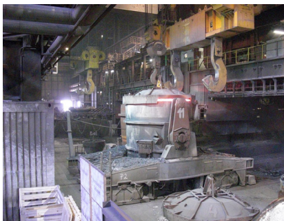
Ladle during casting process

Five precise and industrial-suited thermographic cameras now monitor all ladles during their way through the steelworks to the continuous caster. The cameras of the VarioCAM®-series with their high geometric resolution can display even smallest defects and their outstanding thermal resolution allows for an early detection of thermal abnormalities already during the initial stages. On top of this, the temperature profile of the ladles can be traced over a long period of time via the software interface. The system has been adjusted to the harsh conditions of the foundry, for example by equipping it with solid protective housings, which ensure correct measurements by means of integrated air flushing. Temperature measurements and any occurring alerting are automatically matched with the respective ladles. Thus, ladle breakage can be prevented early on. With all this, ArcelorMittal Bremen minimises their economic risks as well as the hazards posed to their employee's health.