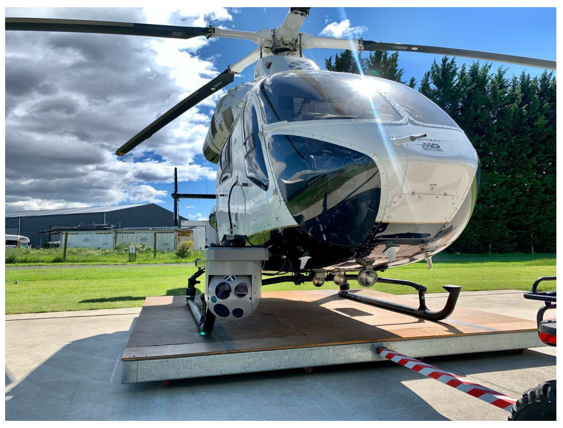
Fig. 4: Bell 206-1 LongRanger with GIMBAL system including VarioCAM ^{\otimes} HD head 800

Additional activities will be related to predictive maintenance of airborne powerline inspection – another good application of aerial thermography. New Zealand's power lines are fed by remote hydro power stations, whose inspection is a vital support for the country's infrastructure.