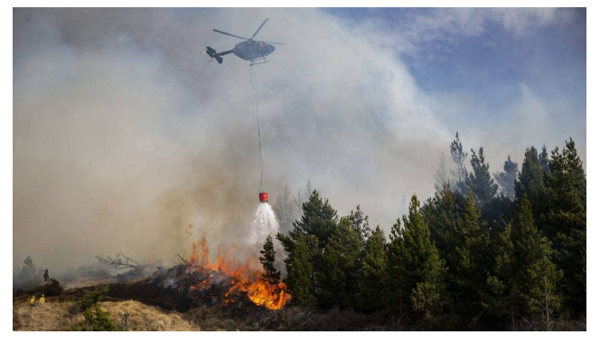
Fig. 3: Helicopter fighting the fire at Lake Pukaki in New Zealand

A case of emergency happened in August 2020 when a large fire showed up near Lake Pukaki. Paul Williams and his Bell had been requested as "Eye in the Sky" when flying to this remote part of the Canterbury district. Their imagery was vital for the effective deployment of firefighters and waterbombers. While 3,500 hectares of wilding pines had been destroyed, no casualties had been reported and there was only minor damage to the few buildings and settlements around.