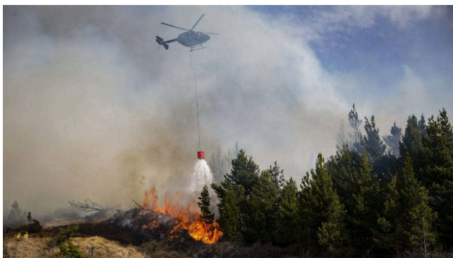
Fig. 3: Helicopter fighting the fire at Lake Pukaki in New Zealand

A case of emergency happened in August 2020 when a large fire showed up near Lake Pukaki. Paul Williams and his Bell had been requested as “Eye in the Sky” when flying to this remote part of the Canterbury district. Their imagery was vital for the effective deployment of firefighters and waterbombers. While 3,500 hectares of wilding pines had been destroyed, no casualties had been reported and there was only minor damage to the few buildings and settlements around.