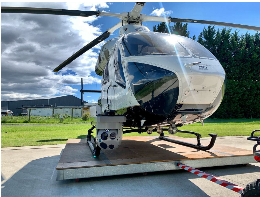
Fig. 4: Bell 206-1 LongRanger with GIMBAL system including VarioCAM® HD head 800

Additional activities will be related to predictive maintenance of airborne powerline inspection – another good application of aerial thermography. New Zealand's power lines are fed by remote hydro power stations, whose inspection is a vital support for the country's infrastructure.