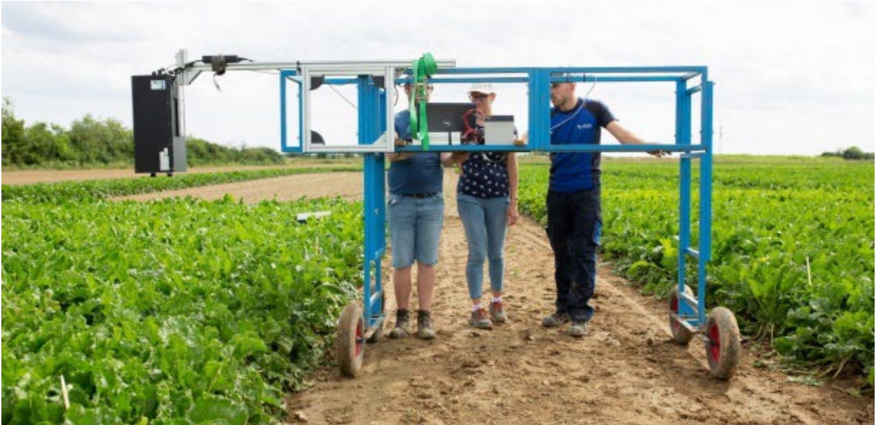
Fig. 1: The measurement set-up for determining the leaf temperature with infrared camera and monitor.

Thermography in Plant Research for Agriculture