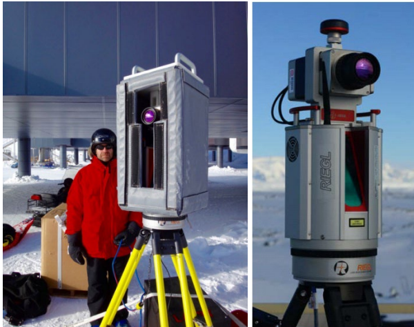
VarioCAM® HD 880 mounted on top of the RIEGL LIDAR.

In order to combine high-resolution position data and thermographic measurements, a powerful set of instruments is required. A VarioCAM® HD 880 has been chosen because of its ruggedized design and thermographic performance. The Lidar system being used is a RIEGL VZ-1000 laser scanner. Both had been placed on a common X-Y platform. The devices can be operated down to temperatures of -20° C, nevertheless the Amundson-Scott campaign required an additional housing since the air temperatures went down to -30 °C during the measuring period.