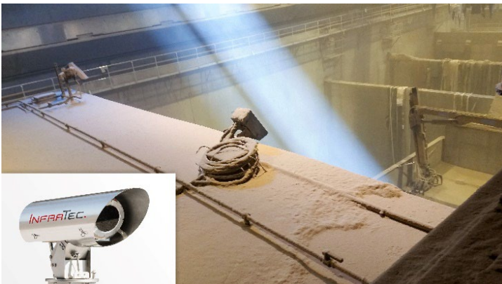
Fig. 1: Permanently installed infrared cameras are used for monitoring the hopper.

On peak days, significantly more than 100 vehicles deliver up to 700 tons of waste in the large storage bunker of the refuse incineration plant, in which several thousand tons of waste are stored. To ensure that this volume can be monitored efficiently and reliably around the clock at ignition sources, e.g. from glowing embers brought in externally or heating induced by the activity of microorganisms, multiple infrared cameras have been used since 2015. Originally started with five cameras, the thermal imaging early fire detection installed onsite meanwhile records a total of seven cameras, which are located in special protective housings. "Two of them are fixed mounted. The employees monitor the hoppers and shredder hole," explains Thomas Andres, operations manager of the EZF. "The remaining cameras are equipped with pan/tilt heads and are used for safeguarding the waste bunker, two storage areas and both crane parking spaces."