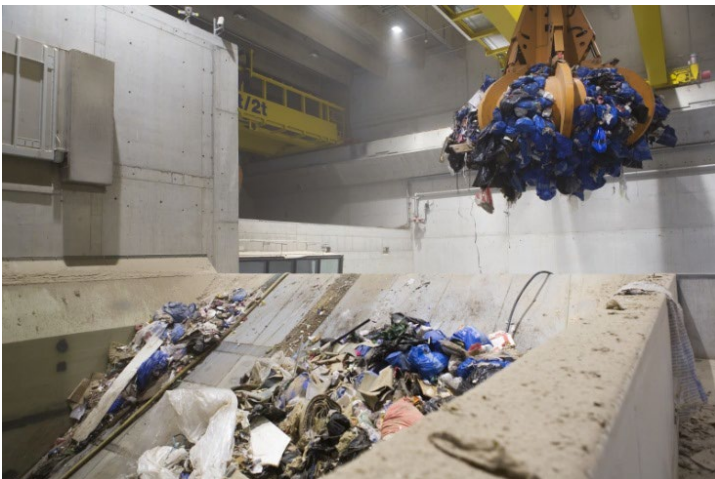
Fig. 4: On certain days, up to 700 tons of waste reach the EZF. After incineration, even the residues contain numerous raw materials that can be reused. In this way, the power plant recovers about 50 kilograms of mercury, 1.5 tons of lead, 60 tons of zinc and one ton of cadmium annually.

One of the main focal points of the development engineers at InfraTec is the trouble-free and preferably comfortable, continuous operation of WASTE-SCAN. This is because there are many other components that have to work flawlessly for a long period of time besides the infrared cameras. This includes, for example, the industrial computers and control cabinets of the system, even when these are not exposed to any exceptional environmental conditions. Pan/tilt heads, connection cables that move almost continuously, and of course the cameras themselves, constantly have to withstand loads due to dirt, heat and smoke.