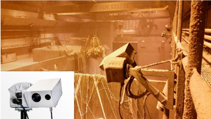
Fig. 2: The combination of pan/tilt heads, infrared cameras and visual cameras offers an excellent overview of the material located in the various stacking compartments.

systems and single cameras are divided into two separate asynchronous systems, both having their own computer software architecture. If one system fails, the other one can be further used autonomously.