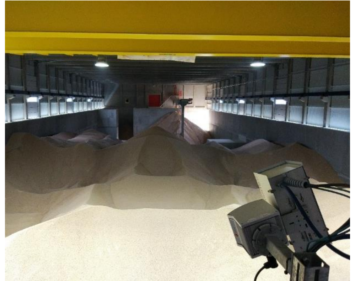
Fig. 2 A view into the pellet store, on the right the VarioCAM® HDx head on an automated pan-tilt head

The FIRE-SCAN fire monitoring system from InfraTec is used in the WUN Bioenergie warehouse. This thermography automation solution is equipped with VarioCAM® HDx head infrared cameras and designed for a 24/7 continuous operation. The very stable and highly accurate digital infrared cameras of the VarioCAM® HDx head series from InfraTec are based on thermally and geometrically high-resolution microbolometer FPA detectors with (640 × 480) IR pixels and provide brilliant 16-bit thermal images in real time.