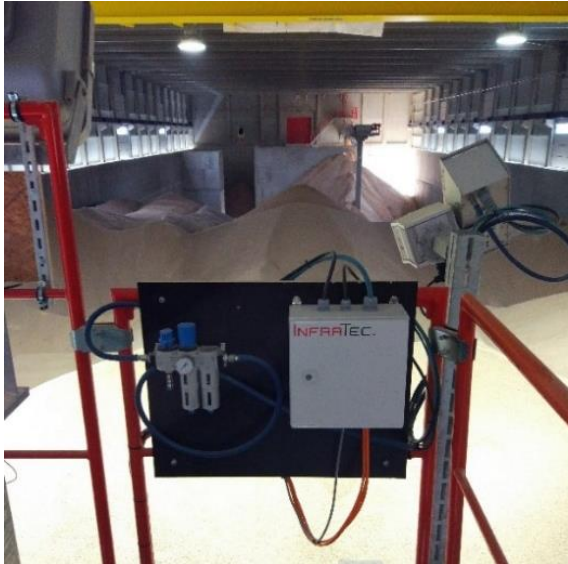
Fig. 1 The heart of the FIRE-SCAN hardware, well protected and equipped for continuous use