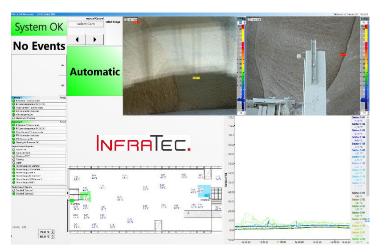
Fig. 3: Everything in view – the FIRE-SCAN user interface

In addition to automated continuous monitoring, the associated software also allows manual interactions the operating personnel. The surface temperatures measured by the cameras ensure constant quality monitoring of the pellets, as the FIRE-SCAN software monitors another threshold temperature in addition to the threshold values for early fire detection. This allows conclusions to be drawn about the moisture content of the pellets. Thus, the crane operator can actively ensure that the drying process runs smoothly. If the system detects a heat nest at up to 40 °C, the pellets are rearranged by the crane system. At 60 °C, they are removed from storage and, in the event of a fire, extinguished with quartz sand if necessary.