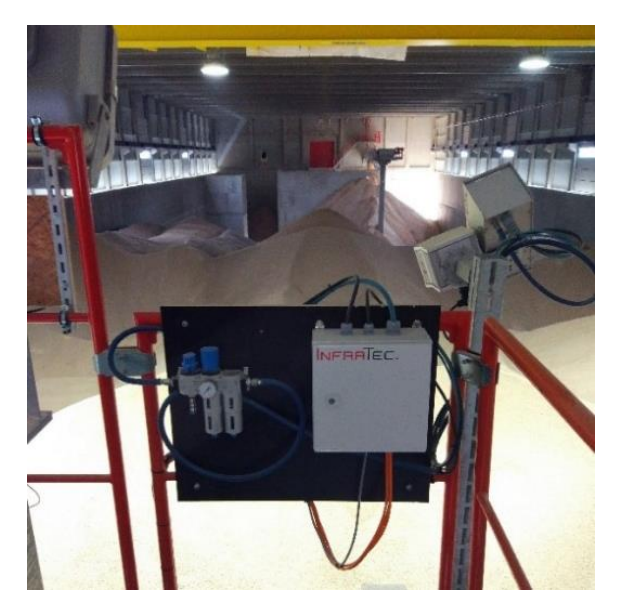
Fig. 1 The heart of the FIRE-SCAN hardware, well protected and equipped for continuous use

FIRE-SCAN monitoring system in pellet production