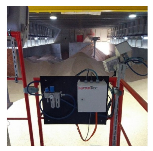
The heart of the FIRE-SCAN hardware, well protected Fig. 1 and equipped for continuous use

FIRE-SCAN monitoring system in pellet production