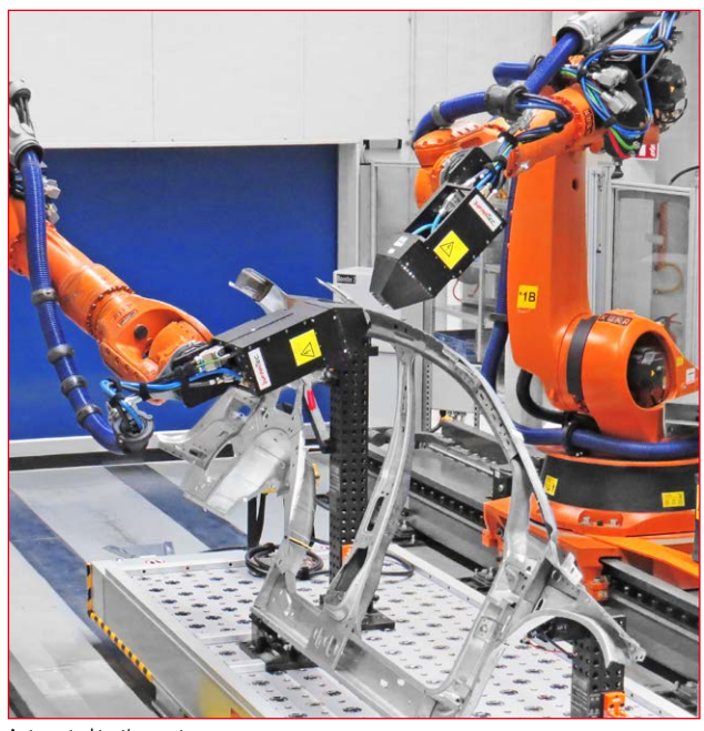
Automated testing system

Detection and classification of various defect types for early detection of deviations in the joining process